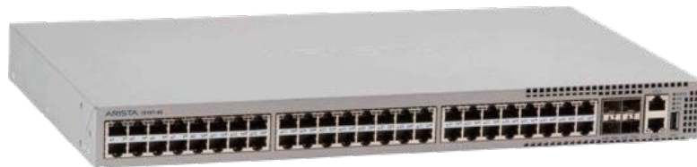
Arista 7010T-48: 48 port 10/100/1000 and 4 port 10GbE Switch

Consuming under 52W the 7010T are extremely power efficient at less than 1W per port. Built in power redundancy and customer reversible redundant fans allows cooling airflow in either forward or reverse direction in a single system.