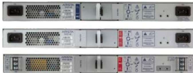
Arista 7010T Rear View - reversible airflow, AC & DC