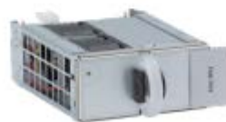
Arista 7010T hot swap and reversible fan module